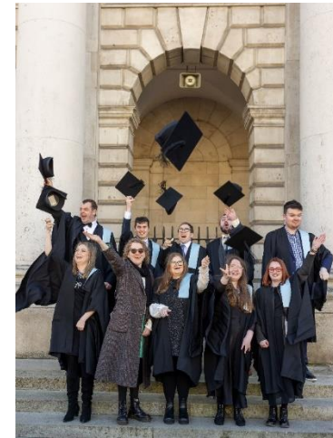
Class of 2025