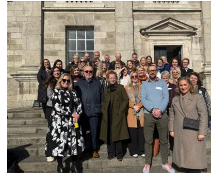
Participants at the TCPID INCLUDE-ID Network employment workshop

Many thanks also to the entire TCPID and School of Education team and the Higher Education Authority for supporting this endeavour through PATH 4 Phase 2.