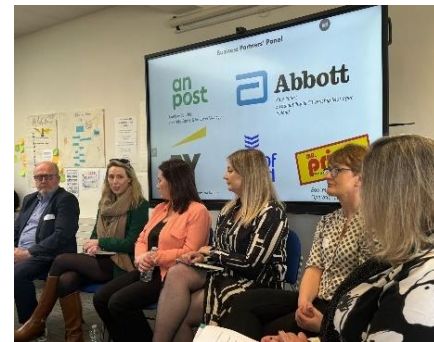
Business Partners discussion panel