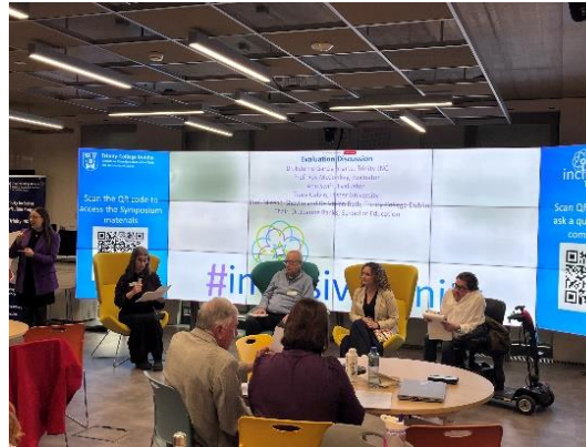
TCPID team at Trinity Inclusive Curriculum Symposium