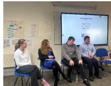
Graduate discussion panel