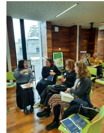
TCPID Business Partners working in groups