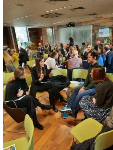
TCPID Business Partners working in groups