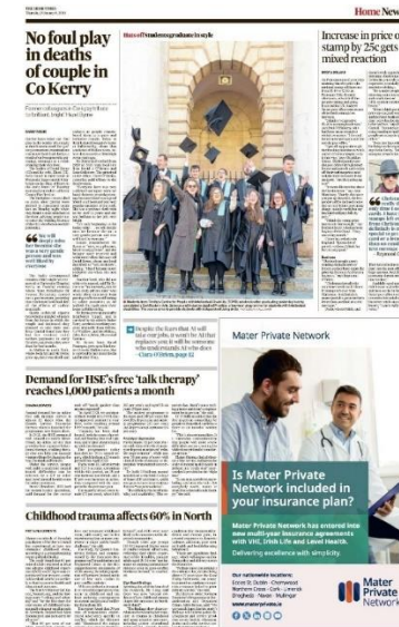
The Irish Times February 6 th 2025

We were thrilled that one of the photos from the graduation appeared in The Irish Times on Thursday February 6th!