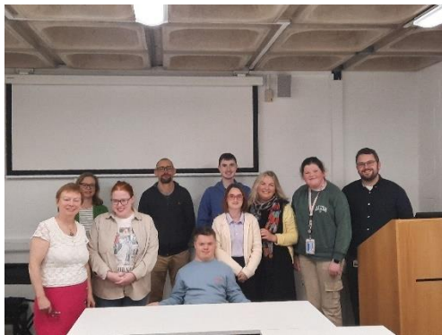
TCPID students and staff with guests from Ornua