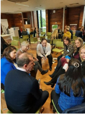
TCPID Business Partners working in groups