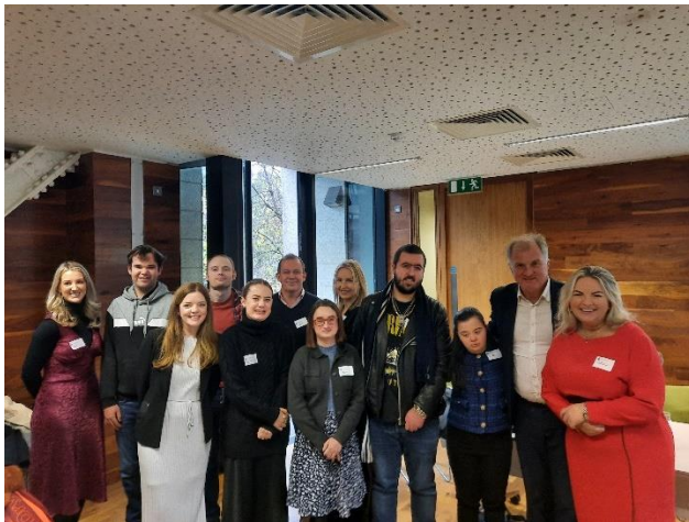
TCPID team and graduates with partners