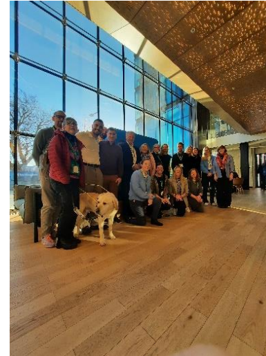
The TCPID and School of Education team with LinkedIn colleagues

On March 4 th the TCPID were also incredibly honoured to be invited to meet with LinkedIn CEO, Ryan Roslansky who was visiting Dublin. This meeting offered an opportunity for Mr. Roslansky to meet with nonprofit organisations who are using LinkedIn in interesting and innovative ways. We were honoured to be one of only 4 organisations who were invited to this meeting. The session focused on highlighting how each of the organisations is using the LinkedIn platform to create economic opportunity for every member of the global workforce.