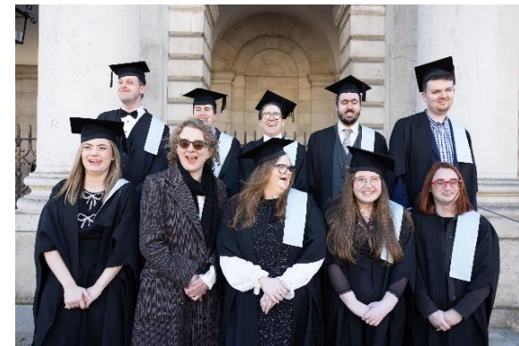
Class of 2025