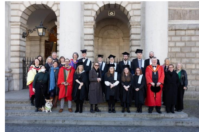
TCPID staff with the new graduates