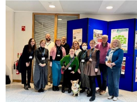
TCPID team at Inclusion in Action Conference in UCC December 2024