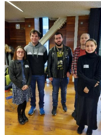
TCPID graduate discussion panel

We are so grateful to everyone who joined us for the meeting and we look forward to continuing to build our wonderful partnerships in 2025.