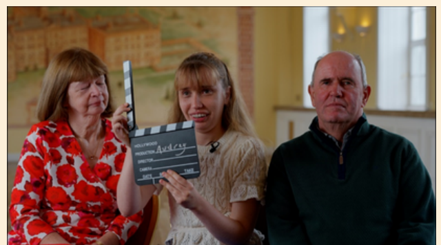
Participants in the Building Circles of Support video