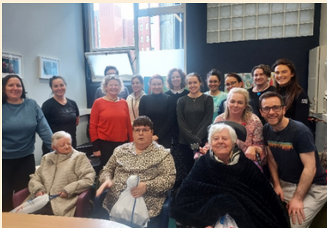
Participants and attendees at the MOSST training day

This training is key to empower nurses and other frontline clinical professionals to collect valid and reliable data on oral health needs within their services.