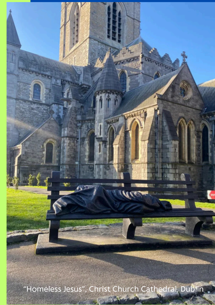
"Homeless Jesus", Christ Church Cathedral, Dublin