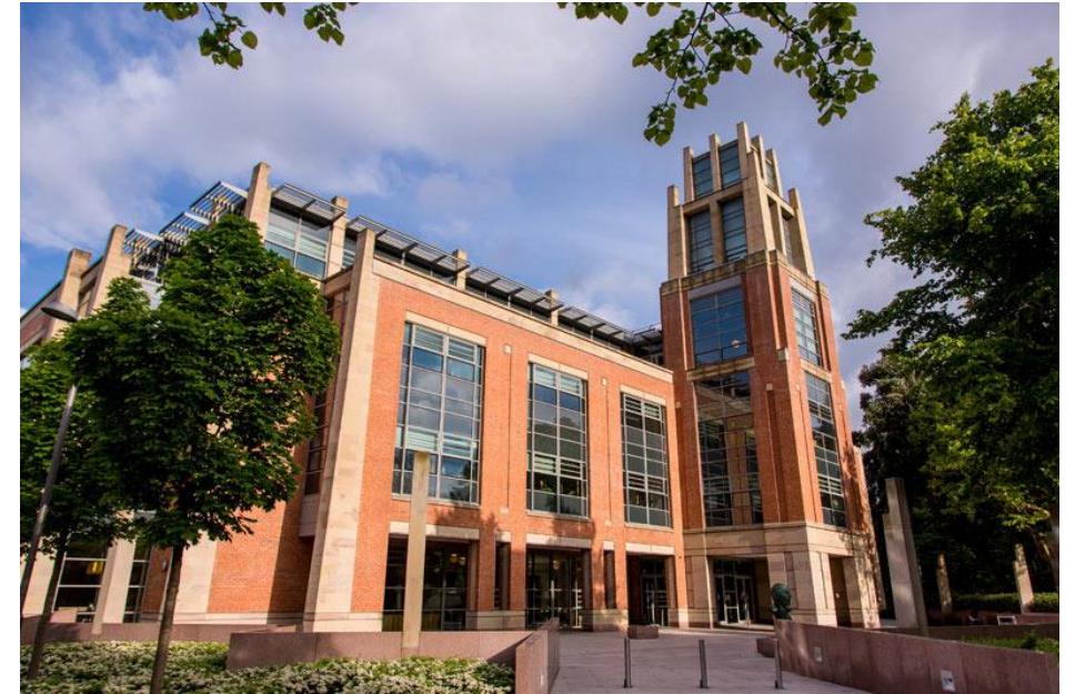
LOCATION - behind Queen's University main building