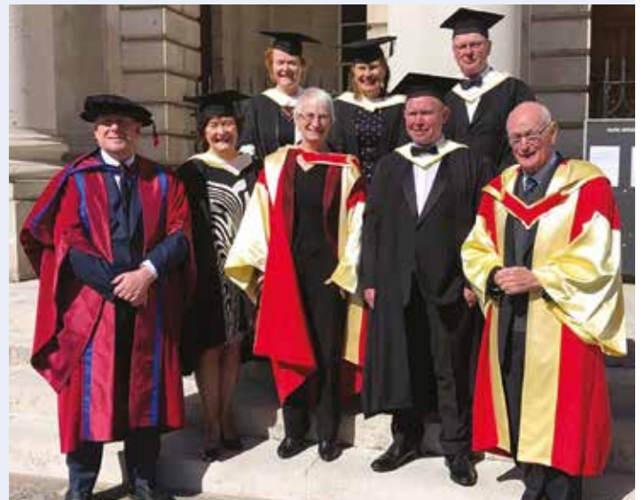
Some of our 2019/20 and 20/21 graduates:

One of the many benefits of studying an MPhil at the Loyola Institute is that I have a reading list for life! Continuing to read key theological texts around the rich modules on offer has allowed me to grow deeper in my understanding of the