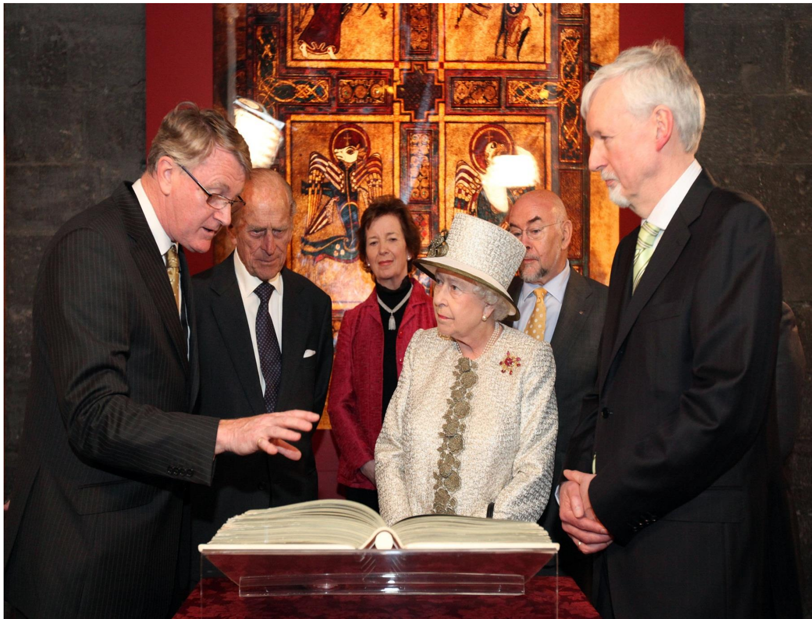
Loyola Institute, TCD 16.2.2017