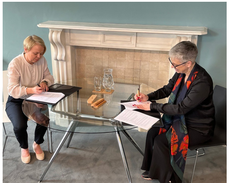
RIGHT: Signing of MOU with the University of Bergen.