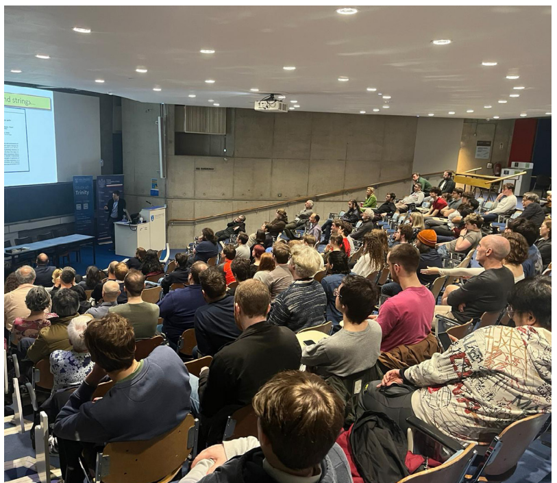
RIGHT: The second annual 'Łukasiewicz Lecture' in collaboration with the Polish Embassy and the School of Mathematics.