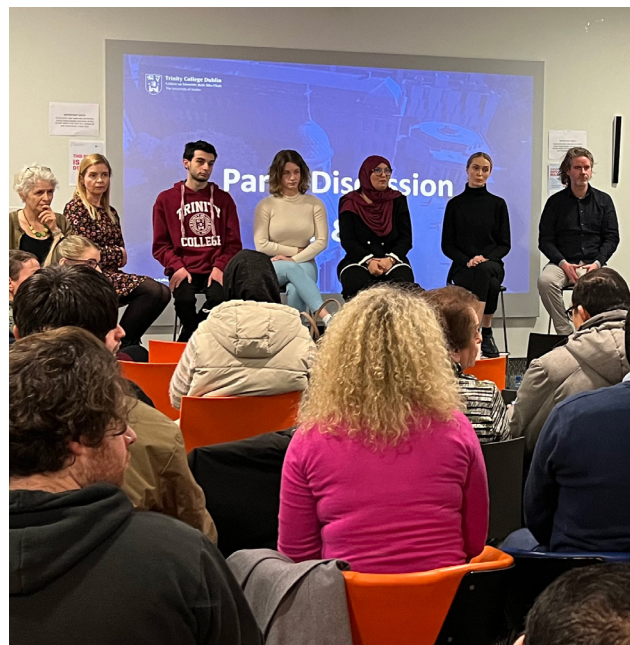
ABOVE: Day of Refugee Solidarity Event.

Trinity launched the University of Sanctuary Steering Group and Fund Advisory Committee to oversee Trinity's University of Sanctuary initiatives. We also appointed a University of Sanctuary Support Officer to support students through their journey at Trinity.