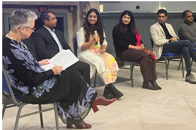
ABOVE: Diwali Event.

Trinity Centre for Literary Translation hosted an event with Booker Prize nominee and Trinity graduate Sebastian Barry and translators of his work in the Long Room Hub in September.