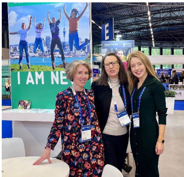
ABOVE: Meeting with new Trinity exchange partner at EAIE Conference.