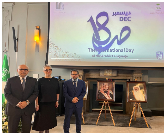
ABOVE: International day of Arabic Language.