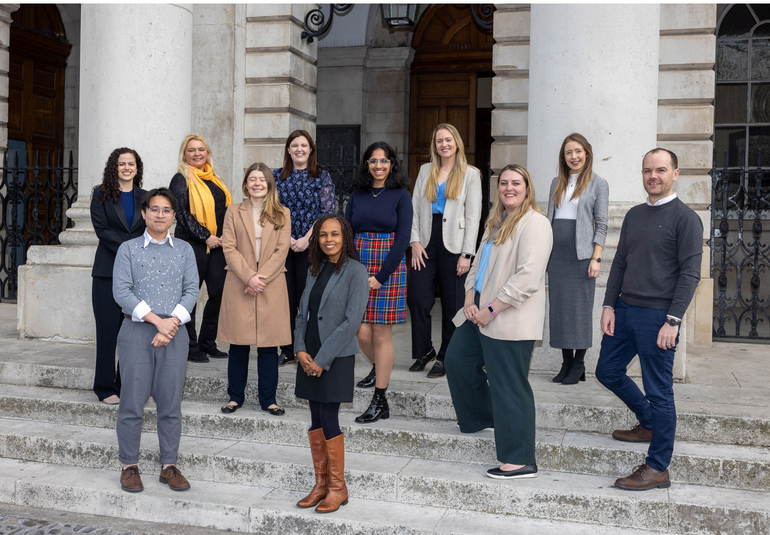
BELOW: Restructured Partnerships and Global Mobility team.