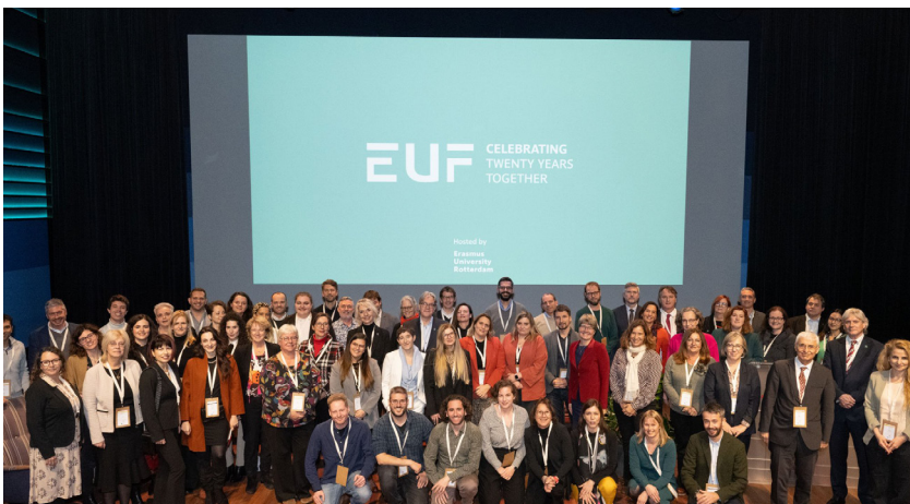
ABOVE : EUF 20th Anniversary

Trinity Global attended the 20-year anniversary celebration of the European University Foundation (EUF) along with more than 80 members. The team also engaged with the EUF on Erasmus specific training.