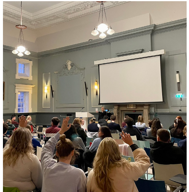
ABOVE: Returning exchange student event.

“While the Global team and I were in Boston and Washington DC with Simon Harris on his ministerial visit, the team worked tirelessly to ensure we made the most of our time, strengthening our undergraduate mobility partnerships at Harvard and other universities and supporting me in forging a new research collaboration with Boston College.”