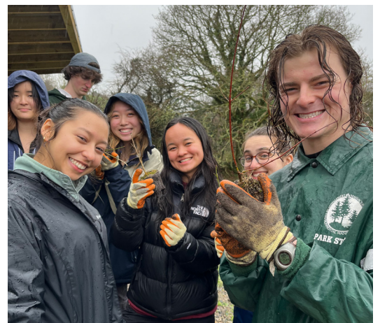
RIGHT: CASA students 2024, Home Tree site visit