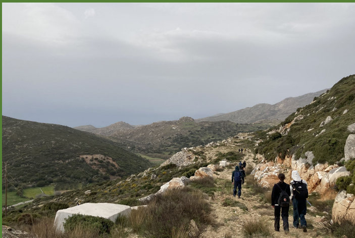
Mapping the metamorphic core complex of Naxos (above).