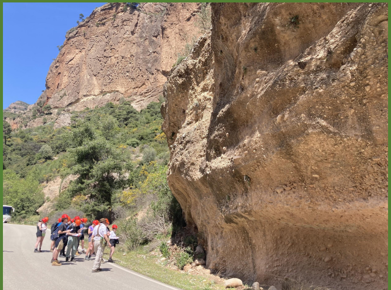
Learning about fan deltas at Kerinitis Gorge, Corinth (right)