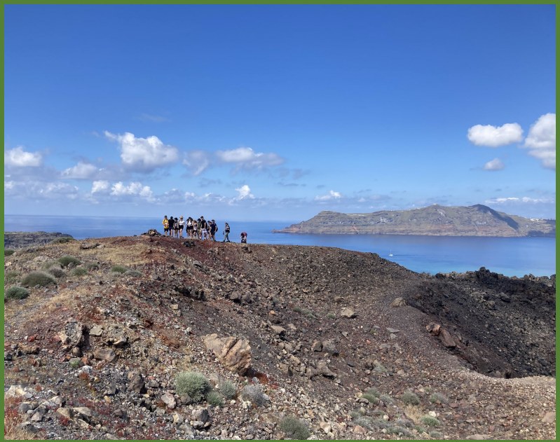
Exploring Nea Kameni island within the Santorini Caldera (above).