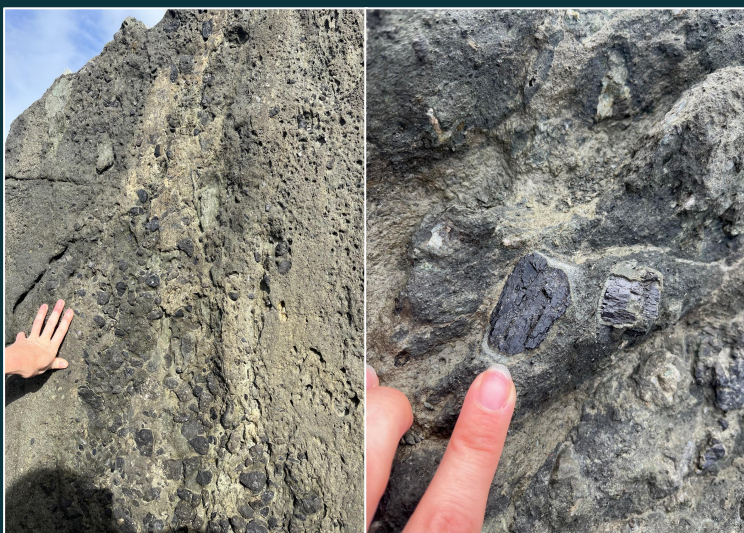
Pipe-like vertical zone of ultramafic nodules (left) and megacrysts (right) found in the diatrema.