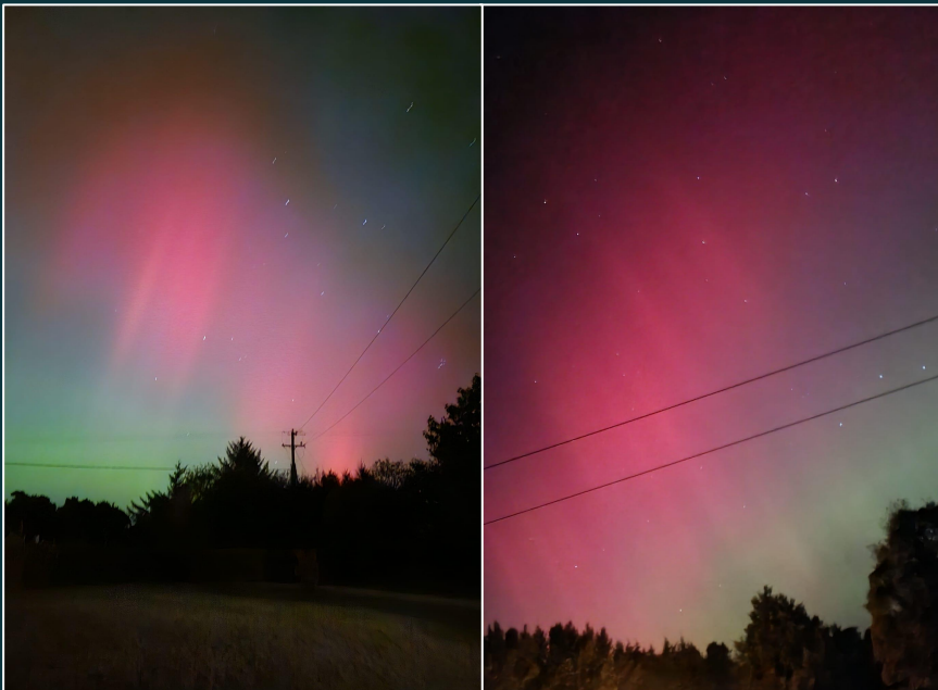
Pictures of the northern lights from Wicklow on October 11.

Also, comet Tsuchinshan-ATLAS visited us for the first time! The orbit of this small body shows that it came directly from the Oort cloud. After going through perihelion on September 27, it started to be visible in the Northern hemisphere. The comet could be seen with the naked eye on the western horizon after sunset during early October.