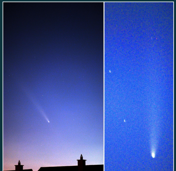
Images of Tsuchinshan-ATLAS comet on October 14.