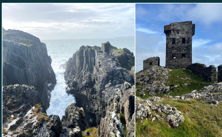
View overlooking the diatrema and out into the Atlantic (left) and Black Ball Head watchtower (right).

You are all warmly invited to the Choral Society's concert, where Bach's Mass in B minor (I, II) and Cantata 140 (Wachet auf) will be performed. The concerts will be held this week, on the 13th and 14th of November in the Trinity Exam Hall (Public Theatre). Tickets are available at FIXR .