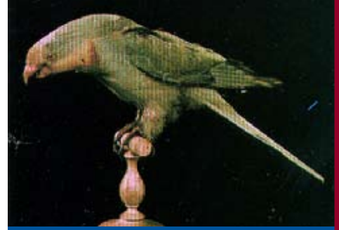
Colour image of a parrot taken by Joly using his 'Joly Method'. This stuffed bird is now in the Department of Geology, TCD.

Towards the end of the nineteenth century William Thomson (later Lord Kelvin) argued that the Earth was between 24 and 40 million years old. However in 1899, Joly published an influential paper in the Scientific Transactions of the Royal