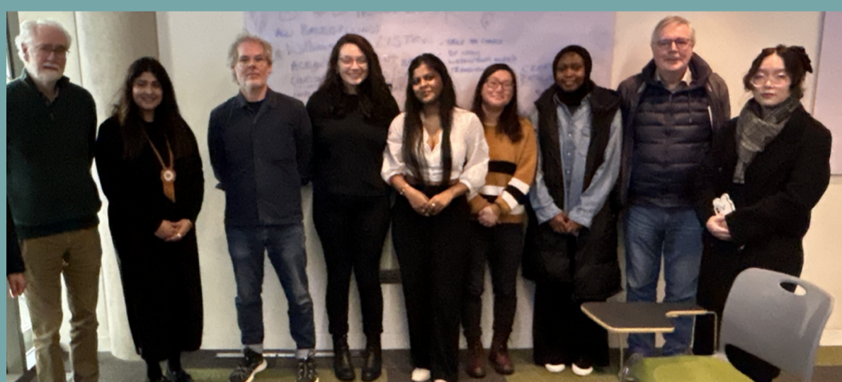
Poerty Matters workshop participants