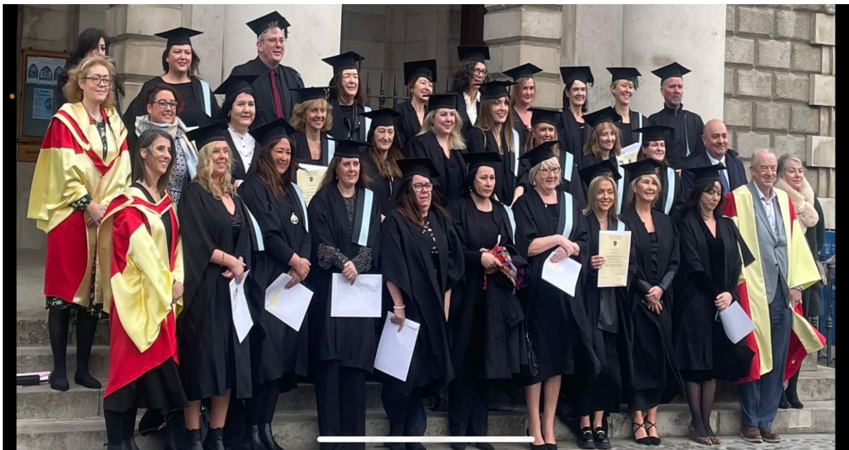
Graduation of Postgraduate Certificate students from the 2021-2022 cohort.

The information provided in this handbook is accurate at time of preparation. Any necessary revisions will be notified to students via e-mail. Please note that in the event of any conflict or inconsistency between the General Regulations published in the University Calendar and information contained in course handbooks, the handbook does not supersede the University regulations in the College Calendar and the provisions of the General Regulations will prevail.