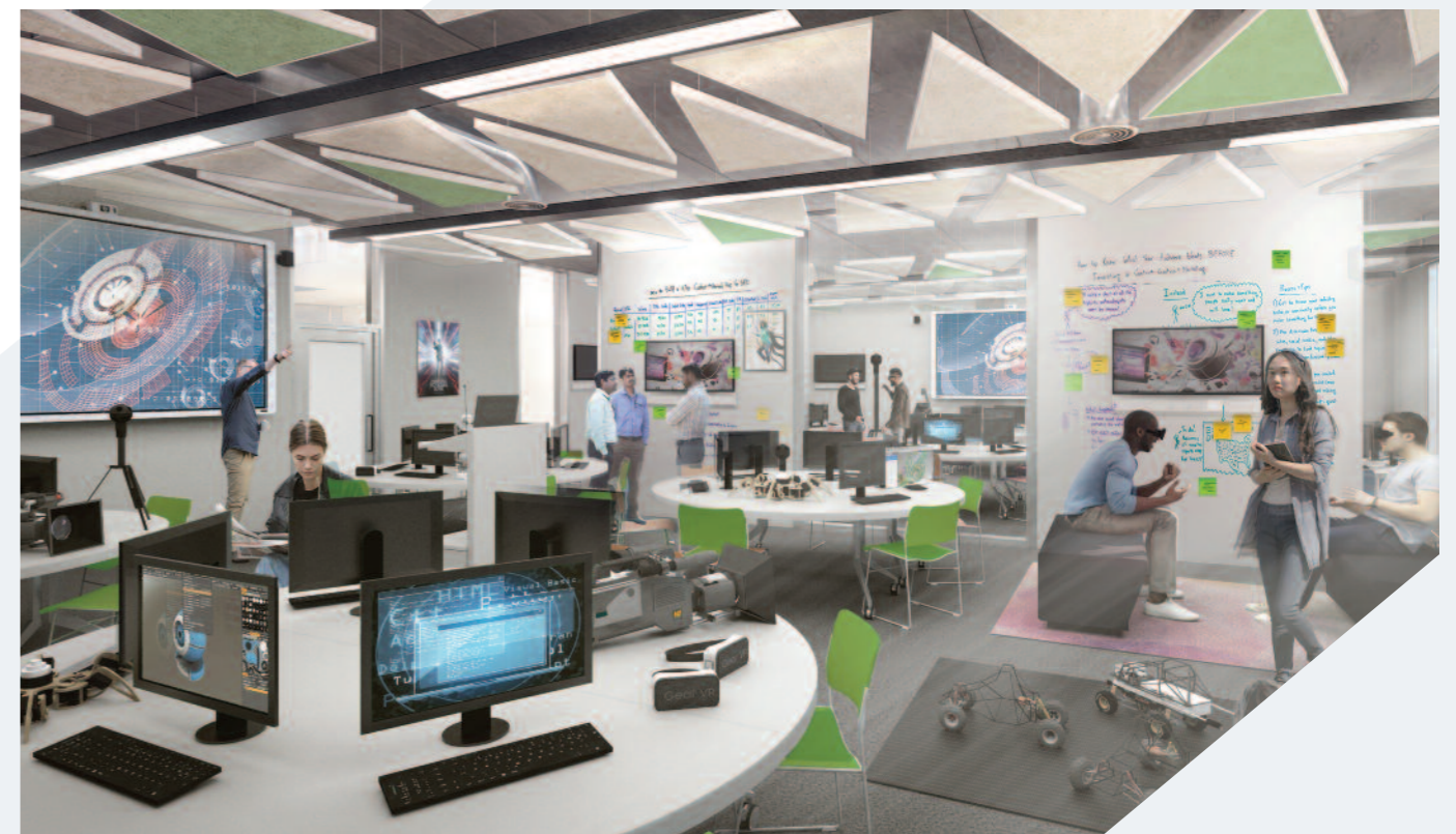
Above: Artist impressions of the new E3 Martin Naughton Learning Foundry (which is due for completion in 2023)