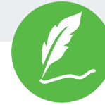
Oscar Wilde Writer