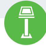
Robert Emmet Revolutionary Leader

In the absence of standardised tests such as SAT or ACT, the Admissions Office will base admissions decisions on high school GPA and transcripts, academic references and personal statements. We will also consider additional evidence of academic merit, including Advanced Placement courses (APs), and college or honours-level classes with strong grades, where relevant to the course for which you are applying. Any standardised test scores that are submitted will be taken into consideration.