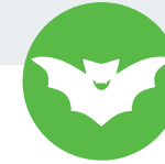
Bram Stoker Writer