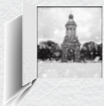
O Come, O Come, Emmanuel First verse is sung by choir only, congregation sings from verse 2:

Giovanni Pierluigi da Palestrina (1525-1594)